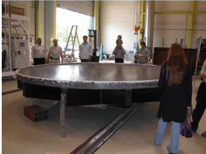
Fig 2: container of the future ILMT.

The liquid mirror container, illustrated in figure 2. The container, also called “bowl”, will be filled with liquid mercury and rotated at a constant speed to form the primary mirror of the telescope. The free surface of a liquid in rotation takes a parabolic shape under the constant pull of gravity and the centrifugal acceleration. Such a surface is ideal for telescope purpose as it focuses all the rays from a paraxial beam at the same point (the focus).