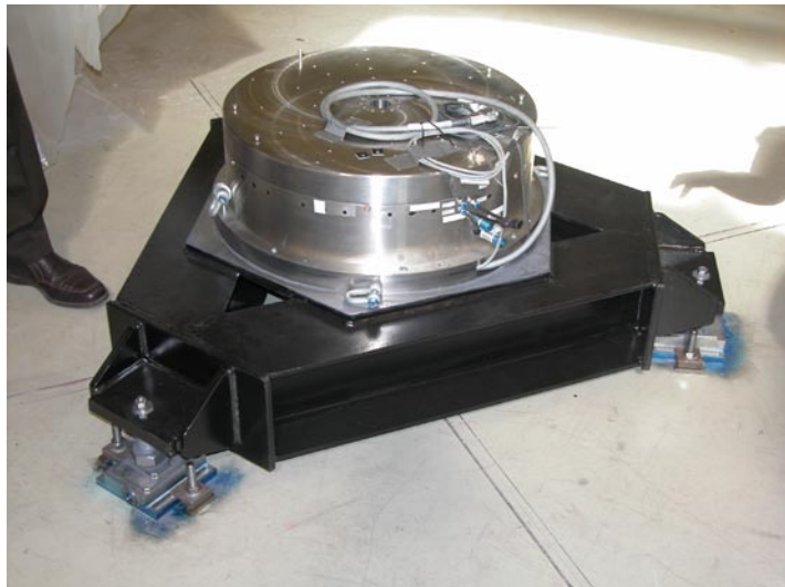
Fig 3: The air bearing resting on its three point mount.

The bowl shown in figure 2 has still to be covered with a layer of polyurethane in order to achieve a shape as near as possible to the final mercury shape. This layer is deposited by spin casting. This process allows to give a good final shape to the polyurethane layer.