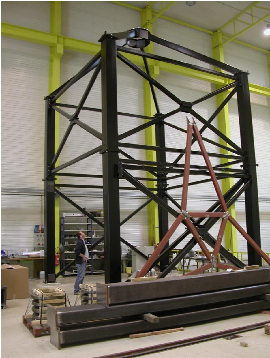
Fig 4: The vertical structure and the spider

The structure is shown in figure 4. It aims at supporting the telescope upper-end and its alignment mechanism. This structure is very simple as the telescope is always vertical. It simply consists in a vertical structure combined with a spider. This structure is now complete.